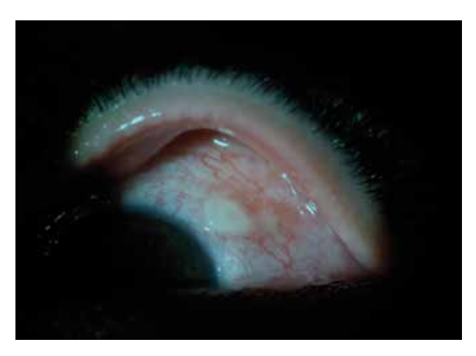
Figure 3. An elevated conjunctival granuloma on the bulbar conjunctiva at the area of vicryl suture removal. The surrounding conjunctiva was moderately injected. The opening of the patient's eye was difficult because of photophobia