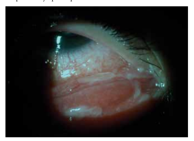
Figure 1. There were small yellow-white color membranes on the lower eyelid tarsal conjunctiva of the left eye. The membranes resemble mucopurulent secretion. There was moderate conjunctival hyperemia on the tarsal and bulbar conjunctiva

The patient was hospitalized, and three different conjunctival cultures (blood, chocolate, and Sabouraud agar) were obtained at his bedside. His antibiotic eye drop was replaced by 0.5% moxifloxacin hydrochloride ophthalmic solution (Vigamox®; Alcon, Fort Worth, TX, USA) and applied 12 times per day. No changes were made to the application of topical steroid. Despite this treatment, there was no clinical improvement after 3 days (Figure 3). All of the cultures taken from the conjunctiva were negative after 3 days. Therefore, we thought it was conjunctival foreign body reaction due to vicryl sutures. For this reason, the vicryl sutures were removed from the conjunctiva but none of the muscular sutures. Topical antibiotic was prescribed four times per day and topical steroid application every hour. Clinical improvement after 7 days of follow-up was minimal; the patient's symptoms persisted.