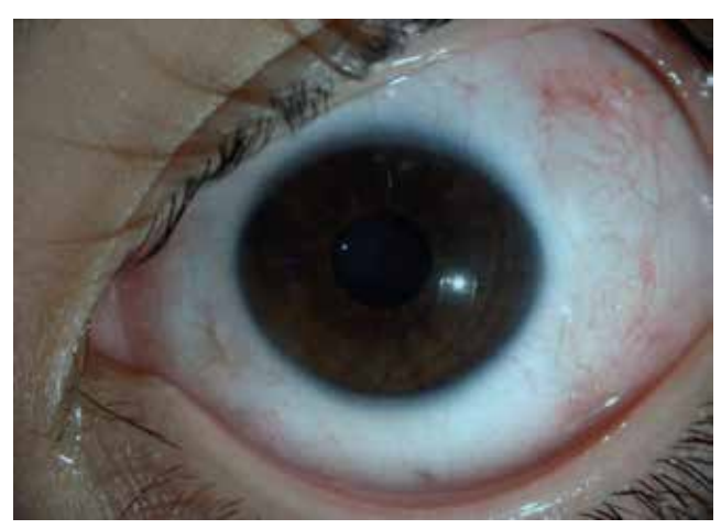
Figure 5. There was almost complete recovery after 5 weeks of the initiation of CsA. Bulbar and tarsal conjunctival hyperemia and the tarsal conjunctival membranes resolved completely

Severe foreign body reactions caused by sutures after ocular surgery in the eyes are often associated with nonabsorbable sutures. Foster et al. 7 described two severe foreign body reactions after ptosis repair using 6-0 polypropylene sutures. Both of the surgeries were uncomplicated, but approximately 3 months after surgery, the patients presented with eyelid edema, pain, and persistent red eye. Despite systemic prednisone treatment, the symptoms were not completely resolved; symptoms improved only with suture removal. Chung et al.8 reported an occult polypropylene suture reaction after ptosis surgery. A polypropylene suture fragment was removed, but an area of conjunctival ulceration remained despite frequent application of topical 1% prednisolone acetate and 4 weeks of oral prednisone at 40-60 mg per day. Conjunctival exploration showed that there was another prolene suture near the cul-de-sac; symptoms were reduced only by removing the suture. Severe foreign body reaction caused by polyglactin 910 material in the tissue is not expected. When a vicryl suture is used for the closure of conjunctiva in humans after pterygium surgery, it may cause a mild foreign body granulation tissue reaction from days 15 to 45 after surgery. 5 Management of the foreign body reaction consists of the removal of the foreign body. Complete improvement of