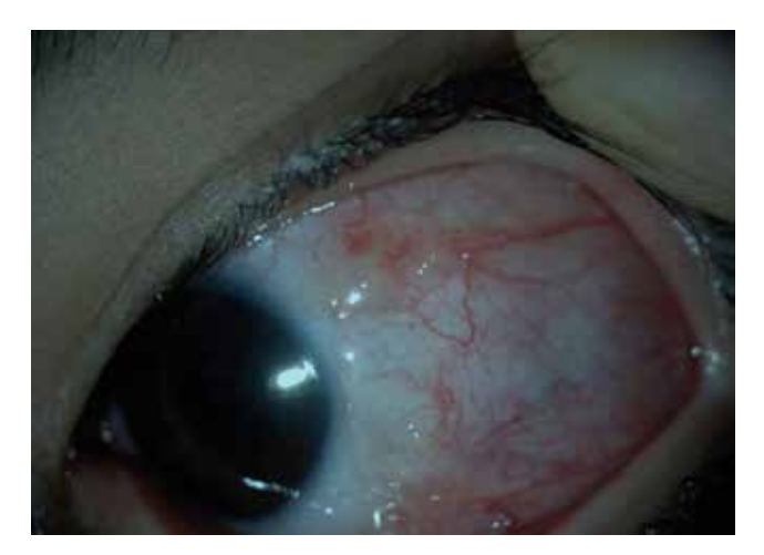
Figure 4. One week after initiation of CsA, there was significant improvement in the clinical findings. But it was not a complete recovery. There were very small conjunctival granulomas that had been seen at the suture removal areas