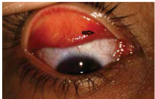
Figure 2. A larva is visible on the conjunctival surface of the upper eyelid on the nasal side (black arrow)