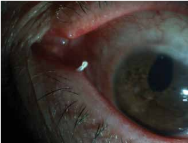
Figure 2. A patient with canaliculitis due to an eyelash entering the left inferior canaliculus