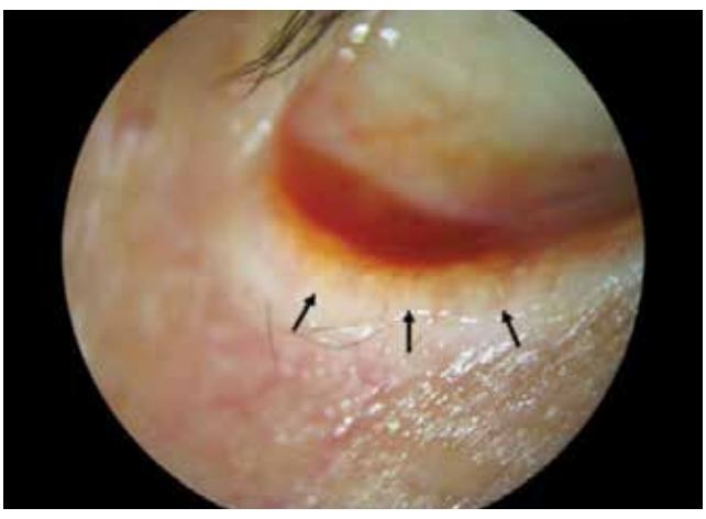
Figure 2. A patient with eyelash loss due to chronic blepharitis. The mucocutaneous junction has anteriorized beyond the meibomian gland orifices, and has reached the base of the eyelash follicles. The arrows indicate the mucocutaneous junction (Lower eyelid has been manually inverted to provide a better image of the mucocutaneous junction)