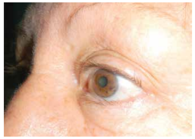
Figure 3. Preoperative appearance of patient with marginal entropion

A thorough examination is crucial for the proper diagnosis and treatment of patients presenting with irritation resulting from contact between the lower eyelashes and the globe. Eyelash contact with the globe may be caused by trichiasis, metaplastic lashes, distichiasis or entropion. As these conditions